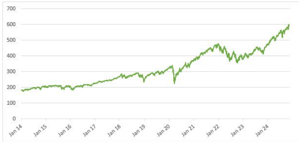
Historical Performance of the SPY

This historical data on the SPY is not necessarily indicative of the future performance of the SPY or what the value of the notes may be. Any historical upward or downward trend in the price of the SPY during any period set forth above is not an indication that the price of the SPY is more or less likely to increase or decrease at any time over the term of the notes.