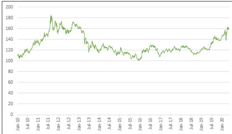
Historical Performance of the Underlying Fund

This historical data on the Underlying Fund is not necessarily indicative of the future performance of the Underlying Fund or what the value of the notes may be. Any historical upward or downward trend in the level of the Underlying Fund during any period set forth above is not an indication that the level of the Underlying Fund is more or less likely to increase or decrease at any time over the term of the notes.