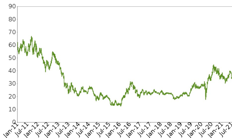
Historical Performance of the Underlying Fund

This historical data on the Underlying Fund is not necessarily indicative of the future performance of the Underlying Fund or what the value of the notes may be. Any historical upward or downward trend in the price of the Underlying Fund during any period set forth above is not an indication that the price of the Underlying Fund is more or less likely to increase or decrease at any time over the term of the notes.