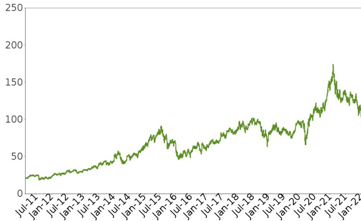
Historical Performance of the Underlying Fund

This historical data on the Underlying Fund is not necessarily indicative of the future performance of the Underlying Fund or what the value of the notes may be. Any historical upward or downward trend in the price per share of the Underlying Fund during any period set forth above is not an indication that the price per share of the Underlying Fund is more or less likely to increase or decrease at any time over the term of the notes.