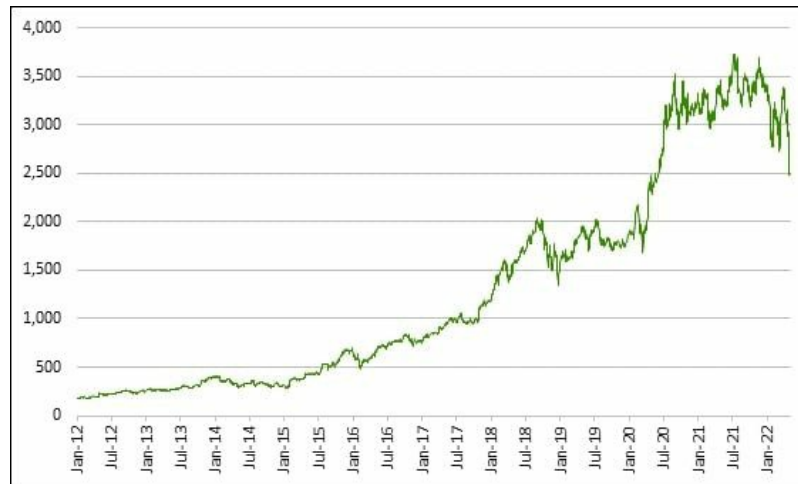
Historical Performance of the Underlying Stock

This historical data on the Underlying Stock is not necessarily indicative of the future performance of the Underlying Stock or what the value of the notes may be. Any historical upward or downward trend in the price of the Underlying Stock during any period set forth above is not an indication that the price of the Underlying Stock is more or less likely to increase or decrease at any time over the term of the notes.