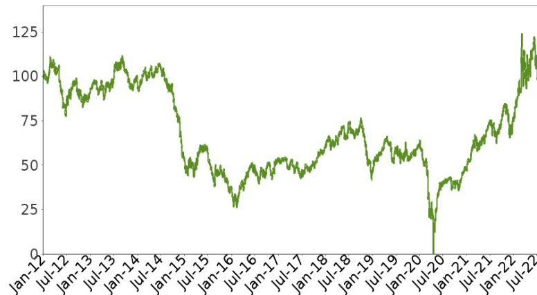
Historical Performance of the First Nearby Month Futures Contract for WTI Light Sweet Crude Oil

This historical data on the WTI Crude Oil Futures Contract is not necessarily indicative of its future performance or what the value of the notes may be. Any historical upward or downward trend in the price of the WTI Crude Oil Futures Contract during any period set forth above is not an indication that the price of the WTI Crude Oil Futures Contract is more or less likely to increase or decrease at any time over the term of the notes.