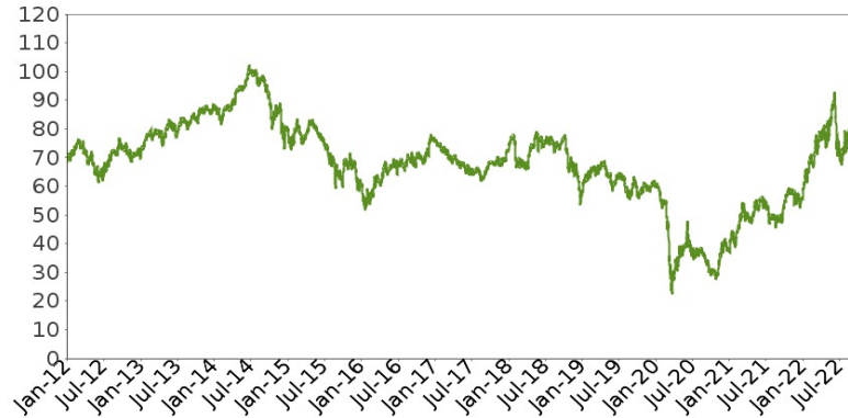
Historical Performance of the Underlying Fund

This historical data on the Underlying Fund is not necessarily indicative of the future performance of the Underlying Fund or what the value of the notes may be. Any historical upward or downward trend in the price of the Underlying Fund during any period set forth above is not an indication that the price of the Underlying Fund is more or less likely to increase or decrease at any time over the term of the notes.