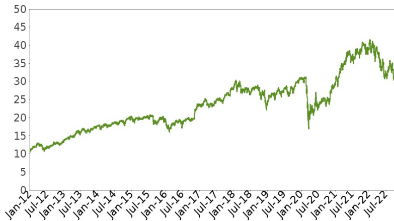
Historical Performance of the Underlying Fund

This historical data on the Underlying Fund is not necessarily indicative of the future performance of the Underlying Fund or what the value of the notes may be. Any historical upward or downward trend in the price of the Underlying Fund during any period set forth above is not an indication that the price of the Underlying Fund is more or less likely to increase or decrease at any time over the term of the notes.