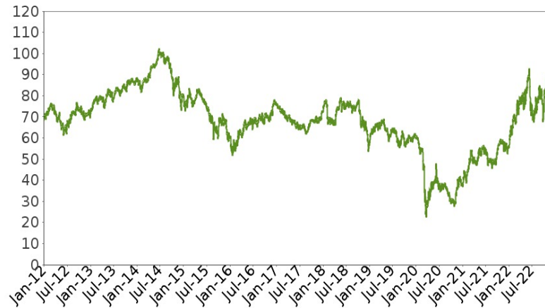
Historical Performance of the Underlying Fund

This historical data on the Underlying Fund is not necessarily indicative of the future performance of the Underlying Fund or what the value of the notes may be. Any historical upward or downward trend in the price of the Underlying Fund during any period set forth above is not an indication that the price of the Underlying Fund is more or less likely to increase or decrease at any time over the term of the notes.