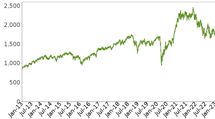
Historical Performance of the Index

This historical data on the Index is not necessarily indicative of the future performance of the Index or what the value of the notes may be. Any historical upward or downward trend in the level of the Index during any period set forth above is not an indication that the level of the Index is more or less likely to increase or decrease at any time over the term of the notes.