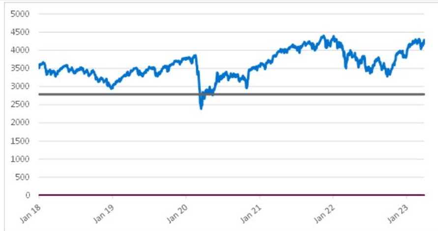
SX5E Daily Closing Values January 2, 2018 to March 30, 2023

*The gray solid line in the graph indicates the hypothetical coupon barrier level and the hypothetical downside threshold level, in each case assuming the index closing value on March 30, 2023 were the initial index value.