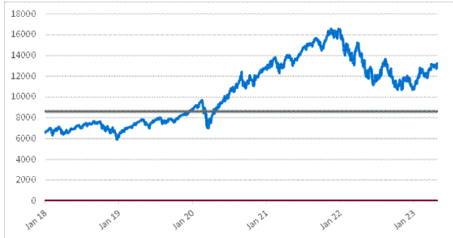
NDX Daily Closing Values January 2, 2018 to April 28, 2023

*The gray solid line in the graph indicates the coupon barrier level and the downside threshold level, based on the initial index value.