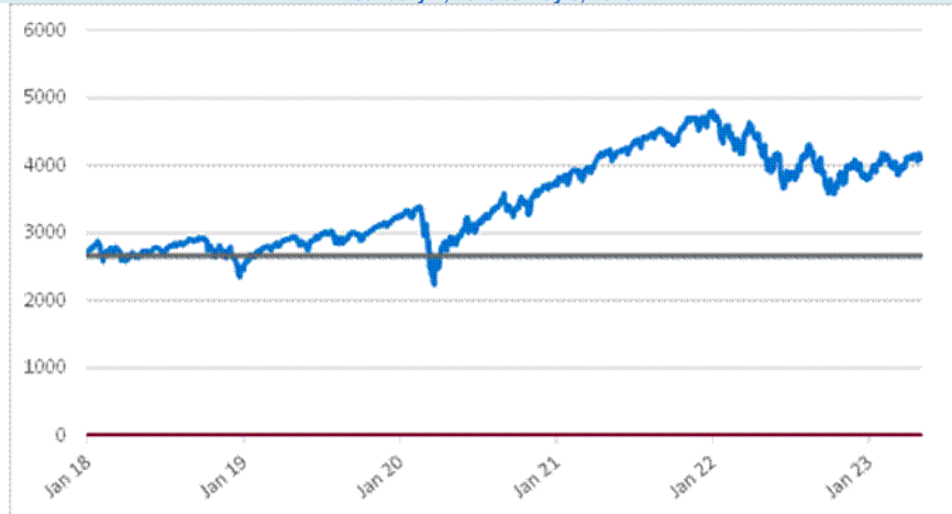
SPX Daily Closing Values January 2, 2018 to May 3, 2023

*The gray solid line in the graph indicates the hypothetical coupon barrier level and the hypothetical downside threshold level, in each case assuming the index closing value on May 3, 2023 were the initial index value.