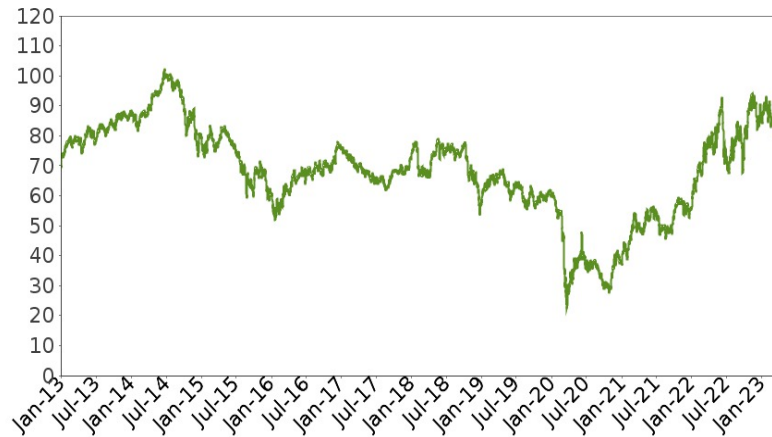
Historical Performance of the Underlying Fund

This historical data on the Underlying Fund is not necessarily indicative of the future performance of the Underlying Fund or what the value of the notes may be. Any historical upward or downward trend in the price of the Underlying Fund during any period set forth above is not an indication that the price of the Underlying Fund is more or less likely to increase or decrease at any time over the term of the notes.