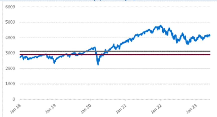
SPX Daily Closing Values January 2, 2018 to May 25, 2023

The following graph sets forth the daily closing values of the SPX for the period from January 2, 2018 through May 25, 2023. The related table sets forth the published high and low closing values, as well as end-of-quarter closing values, of the SPX for each quarter in the same period. The closing value of the SPX on May 25, 2023 was 4,151.28. We obtained the information in the graph and table below from Bloomberg L.P., without independent verification. The SPX has at times experienced periods of high volatility, and you should not take the historical values of the SPX as an indication of its future performance. No assurance can be given as to the level of the SPX during any observation period or on the final observation date.