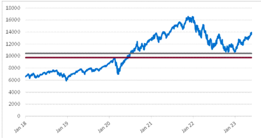
NDX Daily Closing Values January 2, 2018 to May 25, 2023

*The gray solid line in the graph indicates the hypothetical coupon barrier level and the hypothetical downside threshold level, in each case assuming the index closing value on May 25, 2023 were the initial index value.