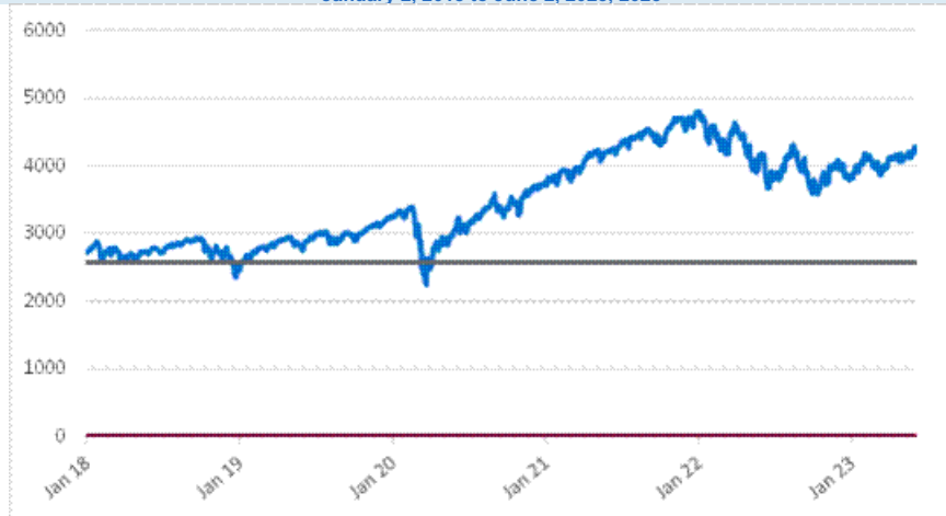
SPX Daily Closing Values January 2, 2018 to June 2, 2023, 2023

*The gray solid line in the graph indicates the coupon barrier level and the downside threshold level, based on the initial index value.