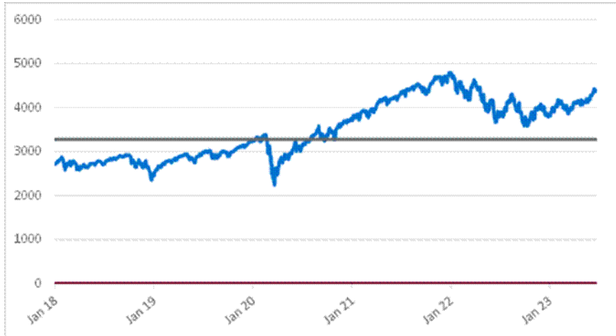
SPX Daily Closing Values January 2, 2018 to June 21, 2023

The following graph sets forth the daily closing values of the SPX for the period from January 2, 2018 through June 21, 2023. The related table sets forth the published high and low closing values, as well as end-of-quarter closing values, of the SPX for each quarter in the same period. The closing value of the SPX on June 21, 2023 was 4,365.69. We obtained the information in the graph and table below from Bloomberg L.P., without independent verification. The SPX has at times experienced periods of high volatility, and you should not take the historical values of the SPX as an indication of its future performance. No assurance can be given as to the level of the SPX during any observation period or on the final observation date.