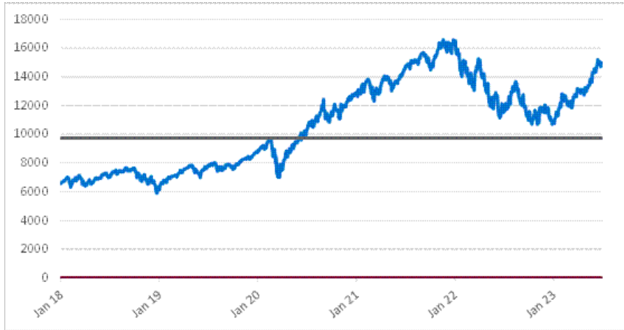
NDX Daily Closing Values January 2, 2018 to June 28, 2023

*The solid line in the graph indicates the hypothetical coupon barrier level and the hypothetical downside threshold level, in each case assuming the index closing value on June 28, 2023 were the initial index value.