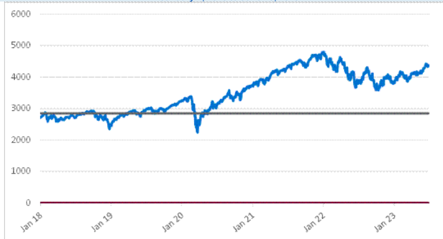
SPX Daily Closing Values January 2, 2018 to June 28, 2023

The following graph sets forth the daily closing values of the SPX for the period from January 2, 2018 through June 28, 2023. The related table sets forth the published high and low closing values, as well as end-of-quarter closing values, of the SPX for each quarter in the same period. The closing value of the SPX on June 28, 2023 was 4,376.86. We obtained the information in the graph and table below from Bloomberg L.P., without independent verification. The SPX has at times experienced periods of high volatility, and you should not take the historical values of the SPX as an indication of its future performance. No assurance can be given as to the level of the SPX during any observation period or on the final observation date.