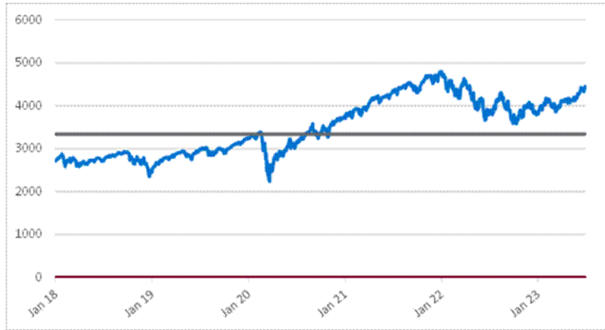
SPX Daily Closing Values January 2, 2018 to June 30, 2023

*The solid line in the graph indicates the coupon barrier level and the downside threshold level based on the initial index value.