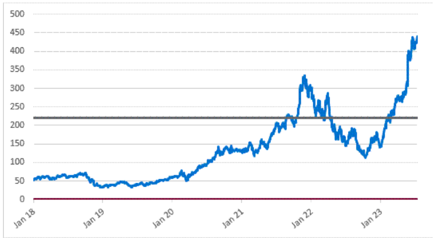
Common Stock of NVIDIA Corporation. – Daily Closing Prices January 2, 2018 to July 12, 2023

*The gray solid line indicates the hypothetical downside threshold price, which is 50% of the hypothetical initial share price as of July 12, 2023.