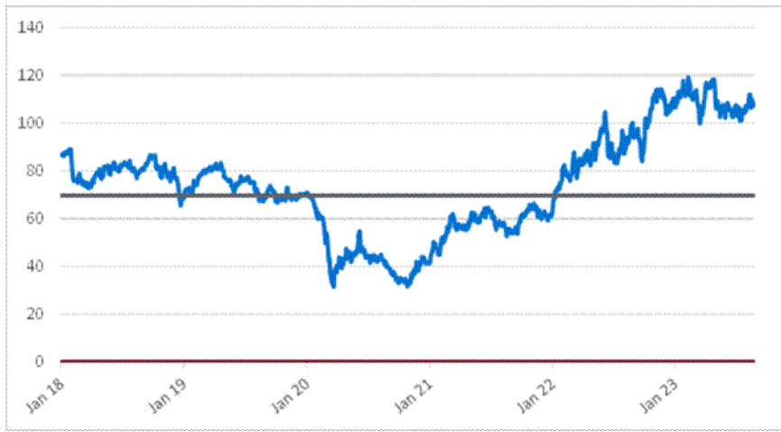
Common Stock of Exxon Mobil Corporation. – Daily Closing Prices January 2, 2018 to August 23, 2023

*The gray solid line indicates the hypothetical downside threshold price, which is 65% of the hypothetical initial share price as of August 23, 2023.