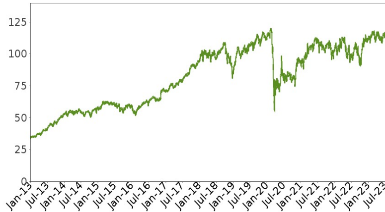
Historical Performance of the Underlying Fund

This historical data on the Underlying Fund is not necessarily indicative of the future performance of the Underlying Fund or what the value of the notes may be. Any historical upward or downward trend in the price of the Underlying Fund during any period set forth above is not an indication that the price of the Underlying Fund is more or less likely to increase or decrease at any time over the term of the notes.