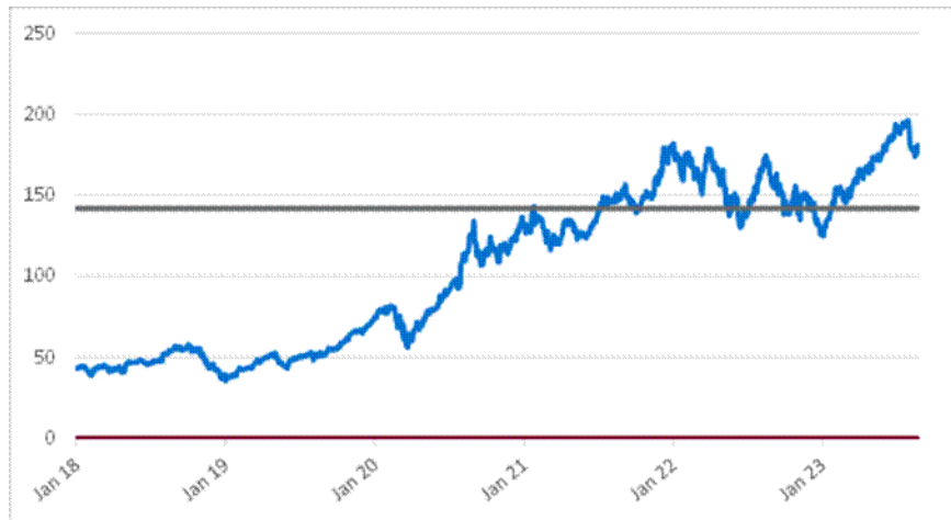
Common Stock of Apple Inc. – Daily Closing Prices January 2, 2018 to September 1, 2023

*The solid line indicates the downside threshold price, which is 75% of the initial share price.