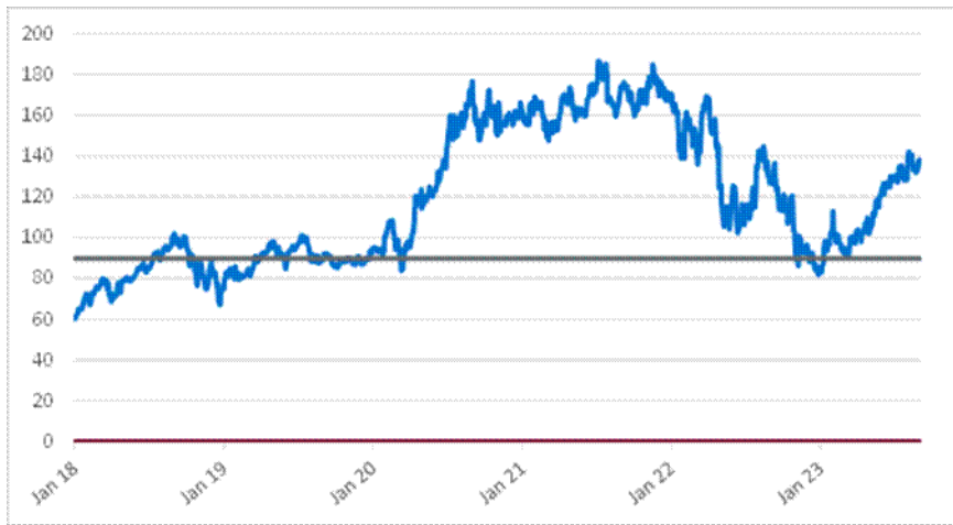
Common Stock of Amazon.com, Inc. – Daily Closing Prices January 2, 2018 to September 1, 2023

*The gray solid line indicates the downside threshold price, which is 65% of the initial share price.