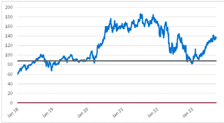
Common Stock of Amazon.com, Inc. – Daily Closing Prices January 2, 2018 to September 6, 2023

*The gray solid line indicates the hypothetical downside threshold price, which is 60% of the hypothetical initial share price as of September 6, 2023.