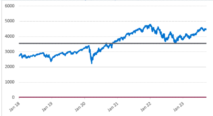
SPX Daily Closing Values January 2, 2018 to September 15, 2023

*The grey solid line in the graph indicates the hypothetical downside threshold level, assuming the index closing value on September 15, 2023 were the initial index value.