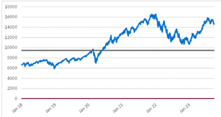
NDX Daily Closing Values January 2, 2018 to September 26, 2023

The following graph sets forth the daily closing values of the NDX for the period from January 2, 2018 through September 26, 2023. The related table sets forth the published high and low closing values, as well as end-of-quarter closing values, of the NDX for each quarter in the same period. The closing value of the NDX on September 26, 2023 was 14,545.83. We obtained the information in the graph and table below from Bloomberg L.P., without independent verification. The NDX has at times experienced periods of high volatility, and you should not take the historical values of the NDX as an indication of its future performance. No assurance can be given as to the level of the NDX during any observation period or on the final observation date.