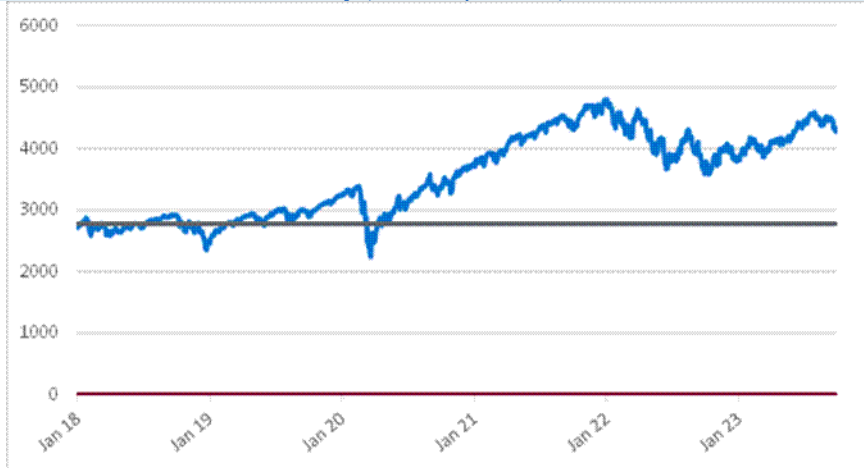
SPX Daily Closing Values January 2, 2018 to September 26, 2023

The following graph sets forth the daily closing values of the SPX for the period from January 2, 2018 through September 26, 2023. The related table sets forth the published high and low closing values, as well as end-of-quarter closing values, of the SPX for each quarter in the same period. The closing value of the SPX on September 26, 2023 was 4,273.53. We obtained the information in the graph and table below from Bloomberg L.P., without independent verification. The SPX has at times experienced periods of high volatility, and you should not take the historical values of the SPX as an indication of its future performance. No assurance can be given as to the level of the SPX during any observation period or on the final observation date.