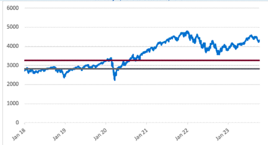
SPX Daily Closing Values January 2, 2018 to October 9, 2023

*The crimson solid line in the graph indicates the hypothetical coupon barrier level and the gray solid line in the graph indicates the hypothetical downside threshold level, in each case assuming the index closing value on October 9, 2023 were the initial index value.