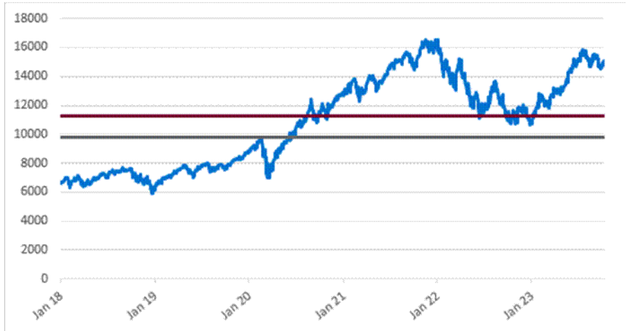
NDX Daily Closing Values January 2, 2018 to October 9, 2023

*The crimson solid line in the graph indicates the hypothetical coupon barrier level and the gray solid line in the graph indicates the hypothetical downside threshold level, in each case assuming the index closing value on October 9, 2023 were the initial index value.