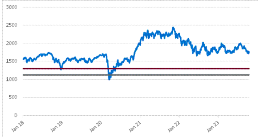
RTY Daily Closing Values January 2, 2018 to October 18, 2023

*The crimson solid line in the graph indicates the coupon barrier level and the gray solid line in the graph indicates the downside threshold level, in each case based on the initial index value.