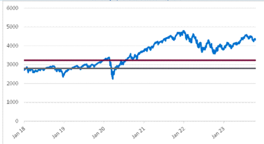
SPX Daily Closing Values January 2, 2018 to October 18, 2023

*The crimson solid line in the graph indicates the coupon barrier level and the gray solid line in the graph indicates the downside threshold level, in each case based on the initial index value.