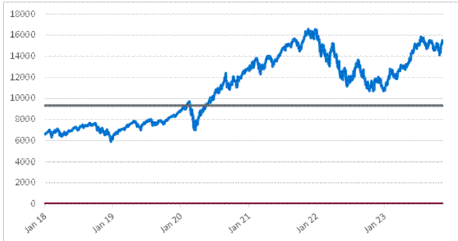
NDX Daily Closing Values January 2, 2018 to November 10, 2023

*The solid line in the graph indicates the coupon barrier level and the downside threshold level, in each case based on the initial index value.