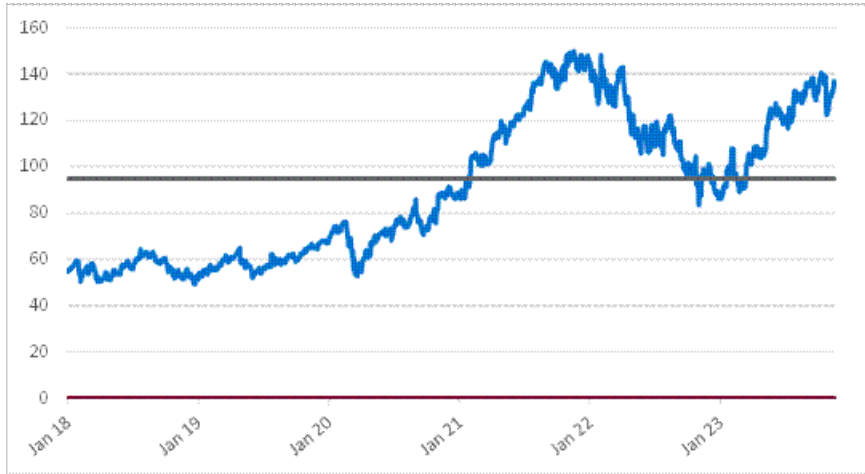
Class A Common Stock of Alphabet Inc. – Daily Closing Prices January 2, 2018 to November 17, 2023

*The solid line indicates the downside threshold price, which is 70% of the initial share price.