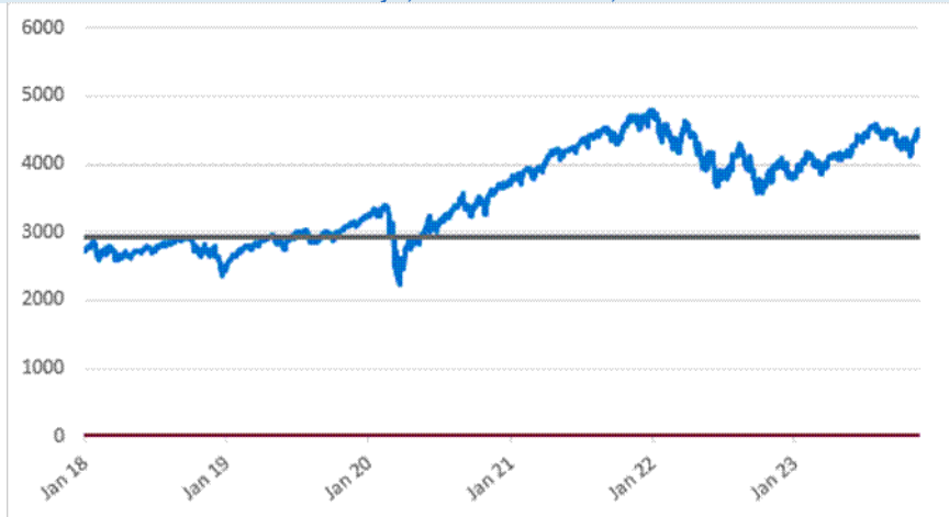
SPX Daily Closing Values January 2, 2018 to November 17, 2023

*The solid line in the graph indicates the coupon barrier level and the downside threshold level, based on the initial index value.