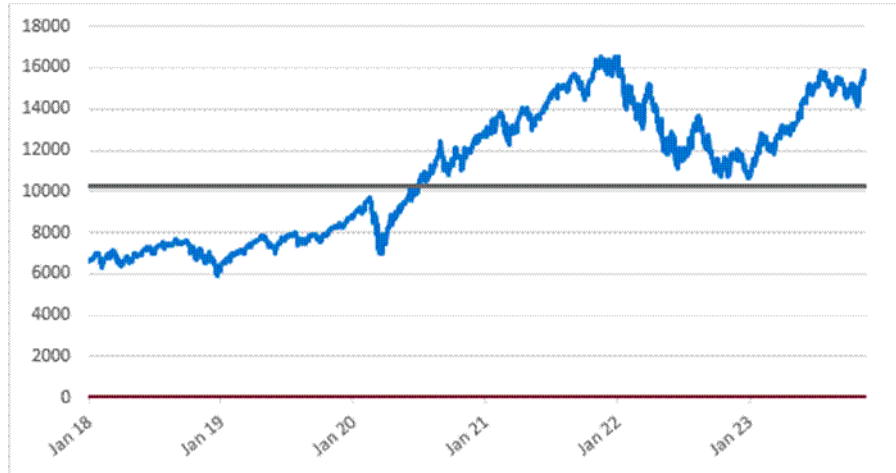
NDX Daily Closing Values January 2, 2018 to November 17, 2023

The following graph sets forth the daily closing values of the NDX for the period from January 2, 2018 through the pricing date. The related table sets forth the published high and low closing values, as well as end-of-quarter closing values, of the NDX for each quarter in the same period. The closing value of the NDX on the pricing date was 15,837.99. We obtained the information in the graph and table below from Bloomberg L.P., without independent verification. The NDX has at times experienced periods of high volatility, and you should not take the historical values of the NDX as an indication of its future performance. No assurance can be given as to the level of the NDX during any observation period or on the final observation date.