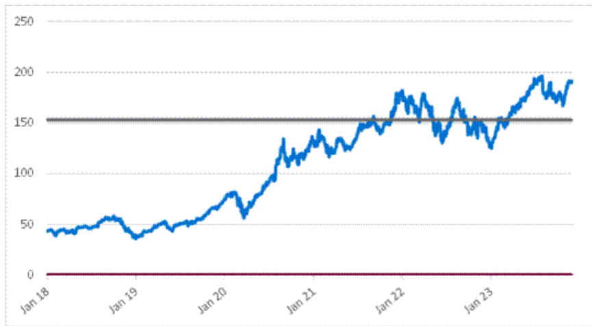
Common Stock of Apple Inc. – Daily Closing Prices January 2, 2018 to December 1, 2023

*The solid line indicates the downside threshold price, which is 80% of the initial share price.