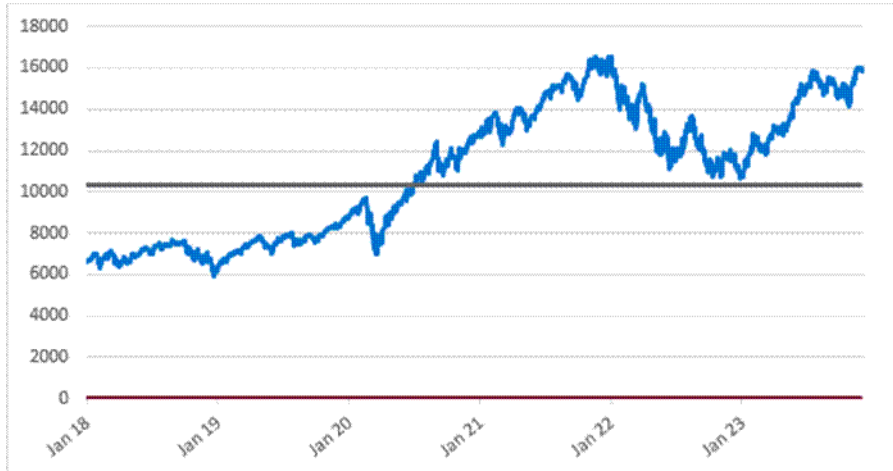
NDX Daily Closing Values January 2, 2018 to December 5, 2023

*The solid line in the graph indicates the hypothetical coupon barrier level and the hypothetical downside threshold level, in each case assuming the index closing value on December 5, 2023 were the initial index value.