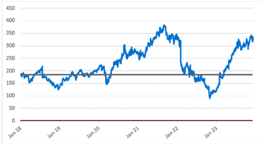
Class A Common Stock of Meta Platforms, Inc. – Daily Closing Prices January 2, 2018 to December 12, 2023

*The gray solid line indicates the hypothetical downside threshold price, which is 55% of the hypothetical initial share price as of December 12, 2023.