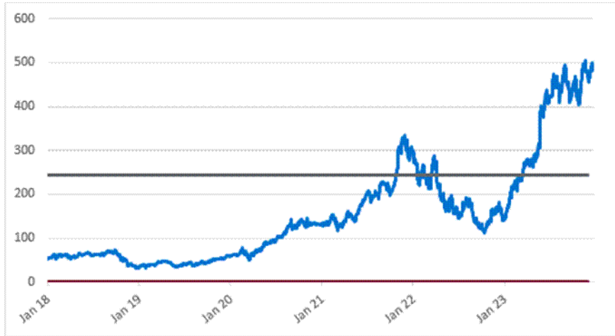
Common Stock of NVIDIA Corporation. – Daily Closing Prices January 2, 2018 to December 22, 2023

*The gray solid line indicates the downside threshold price, which is 50% of the initial share price.