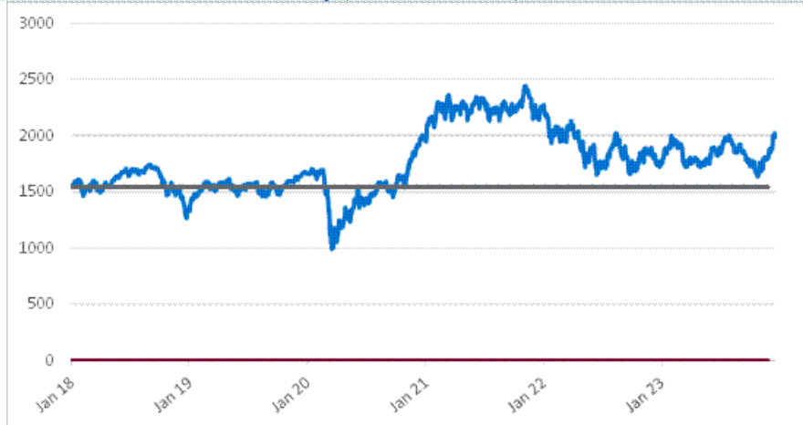
RTY Daily Closing Values January 2, 2018 to December 28, 2023

*The solid line in the graph indicates the coupon barrier level and downside threshold level, each of which is 75% of the initial index value.