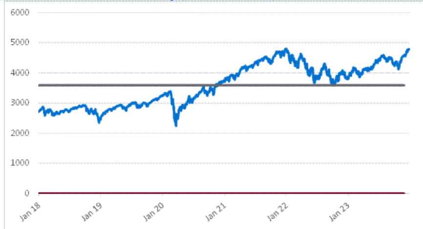
SPX Daily Closing Values January 2, 2018 to December 28, 2023

*The solid line in the graph indicates the coupon barrier level and downside threshold level, each of which is 75% of the initial index value.