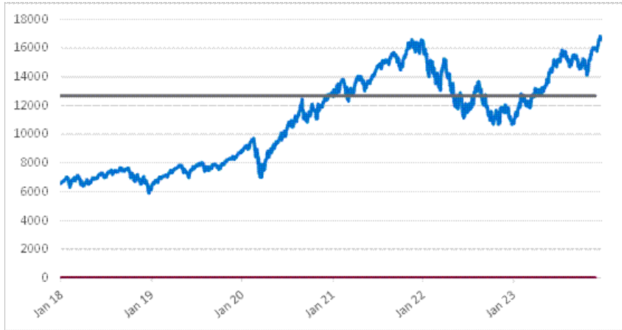
NDX Daily Closing Values January 2, 2018 to December 28, 2023

*The solid line in the graph indicates the coupon barrier level and downside threshold level, each of which is 75% of the initial index value.