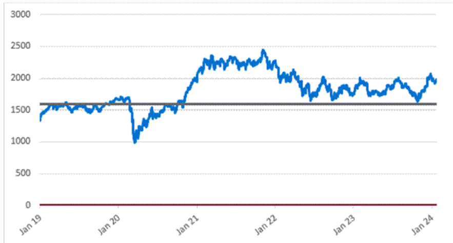
RTY Daily Closing Values January 2, 2019 to January 22, 2024

*The grey solid line in the graph indicates the hypothetical downside threshold level, which is 80% of the hypothetical index closing value on January 22, 2024.