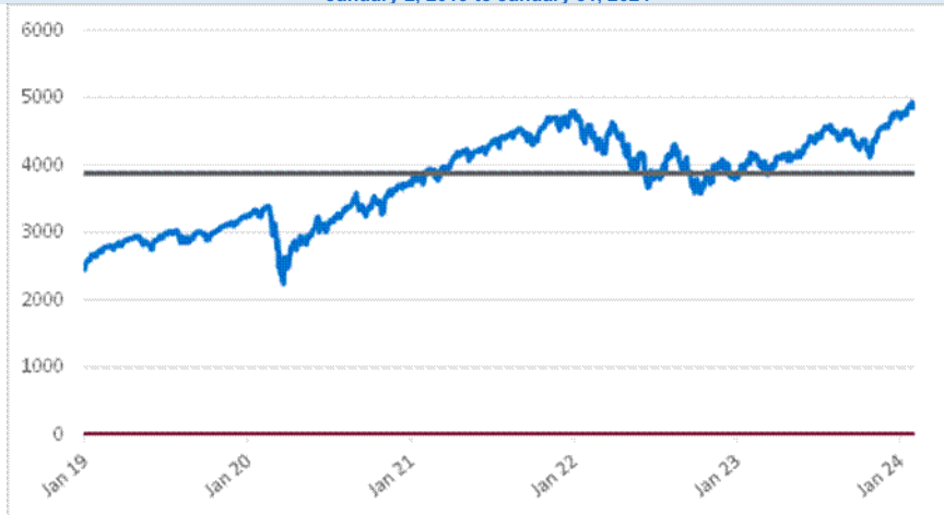
SPX Daily Closing Values January 2, 2019 to January 31, 2024

*The grey solid line in the graph indicates the downside threshold level, which is 80% of the index closing value.