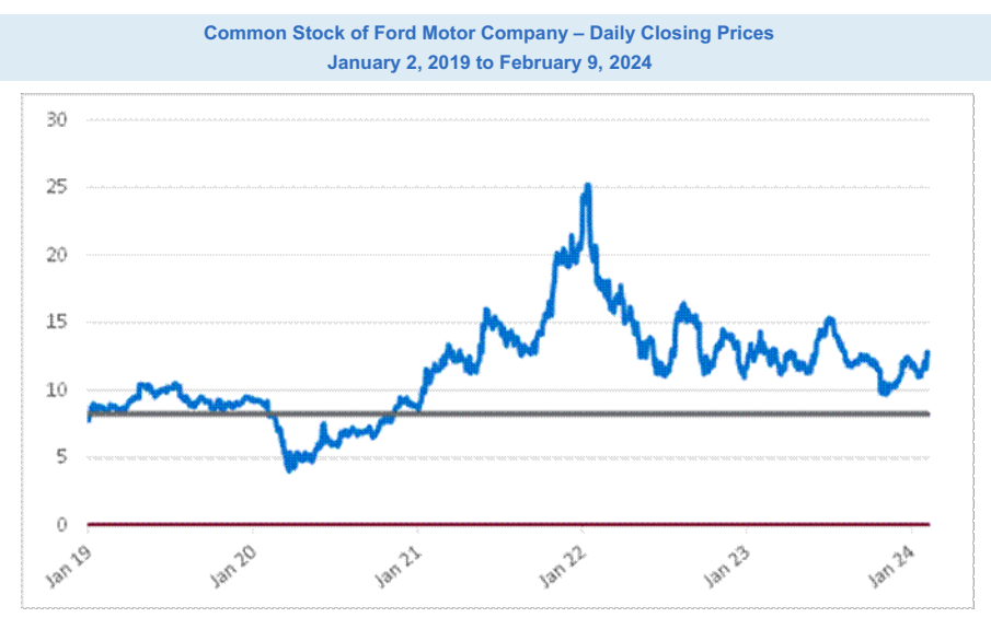
*The gray solid line indicates the downside threshold price, which is 65% of the initial share price.