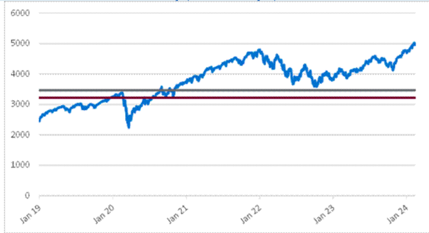
SPX Daily Closing Values January 2, 2019 to February 13, 2024

*The gray solid line in the graph indicates the coupon barrier level, which is 70% of the initial index value, and the crimson solid line in the graph indicates the downside threshold level, which is 65% of the initial index value.