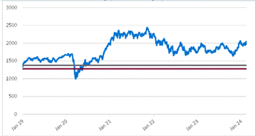
RTY Daily Closing Values January 2, 2019 to February 13, 2024

*The gray solid line in the graph indicates the coupon barrier level, which is 70% of the initial index value, and the crimson solid line in the graph indicates the downside threshold level, which is 65% of the initial index value.