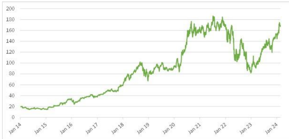
Historical Performance of the Underlying Stock

This historical data on the Underlying Stock is not necessarily indicative of the future performance of the Underlying Stock or what the value of the notes may be. Any historical upward or downward trend in the price per share of the Underlying Stock during any period set forth above is not an indication that the price per share of the Underlying Stock is more or less likely to increase or decrease at any time over the term of the notes.