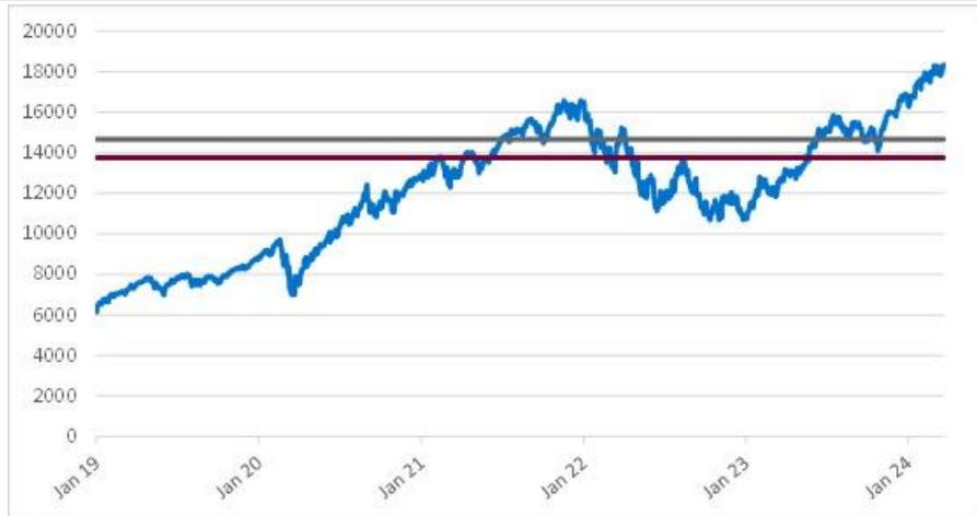
NDX Daily Closing Values January 2, 2019 to March 22, 2024

The following graph sets forth the daily closing values of the NDX for the period from January 2, 2019 through the pricing date. The related table sets forth the published high and low closing values, as well as end-of-quarter closing values, of the NDX for each quarter in the same period. The closing value of the NDX on the pricing date was 18,339.44. We obtained the information in the graph and table below from Bloomberg L.P., without independent verification. The NDX has at times experienced periods of high volatility, and you should not take the historical values of the NDX as an indication of its future performance. No assurance can be given as to the level of the NDX during any observation period or on the final observation date.