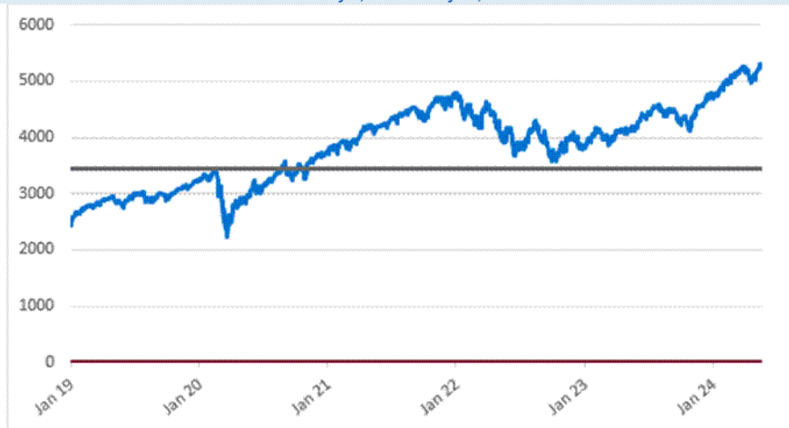
SPX Daily Closing Values January 2, 2019 to May 17, 2024

*The solid line in the graph indicates the coupon barrier level and the downside threshold level, which in each case is 65% of the initial index value.