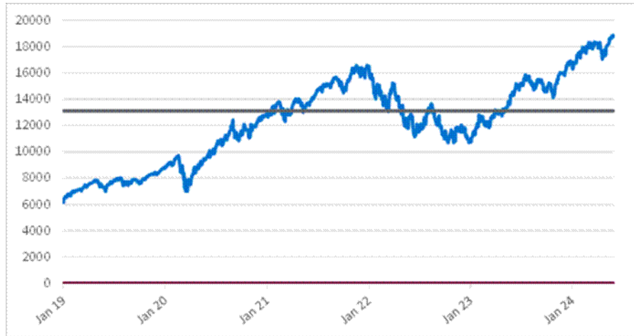
NDX Daily Closing Values January 2, 2019 to May 29, 2024

The following graph sets forth the daily closing values of the NDX for the period from January 2, 2019 through May 29, 2024. The related table sets forth the published high and low closing values, as well as end-of-quarter closing values, of the NDX for each quarter in the same period. The closing value of the NDX on May 29, 2024 was 18,736.75. We obtained the information in the graph and table below from Bloomberg L.P., without independent verification. The NDX has at times experienced periods of high volatility, and you should not take the historical values of the NDX as an indication of its future performance. No assurance can be given as to the level of the NDX during any observation period or on the final observation date.