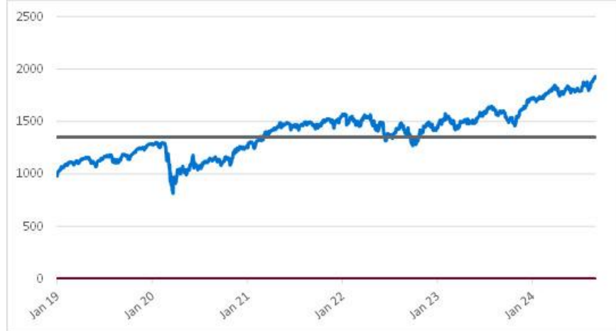
SVX Daily Index Closing Values January 2, 2019 to August 30, 2024

*The solid line in the graph indicates the trigger level, which is 70% of the initial index value. August 2024