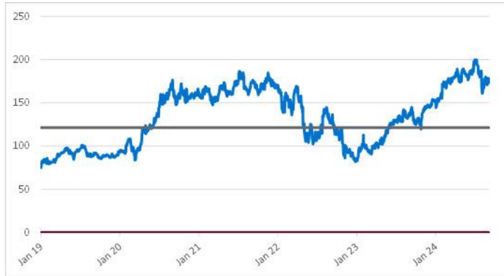
Common Stock of Amazon.com, Inc. – Daily Closing Prices January 2, 2019 to September 4, 2024

*The gray solid line indicates the hypothetical downside threshold price, which is 70% of the hypothetical initial share price as of September 4, 2024.