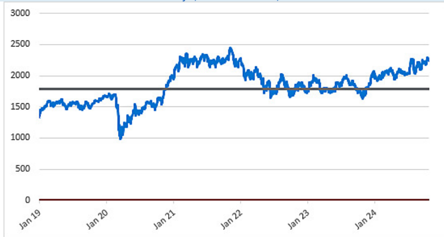
RTY Daily Closing Values January 2, 2019 to October 21, 2024

*The grey solid line in the graph indicates the hypothetical downside threshold level, which is 80% of the hypothetical index closing value on October 21, 2024.