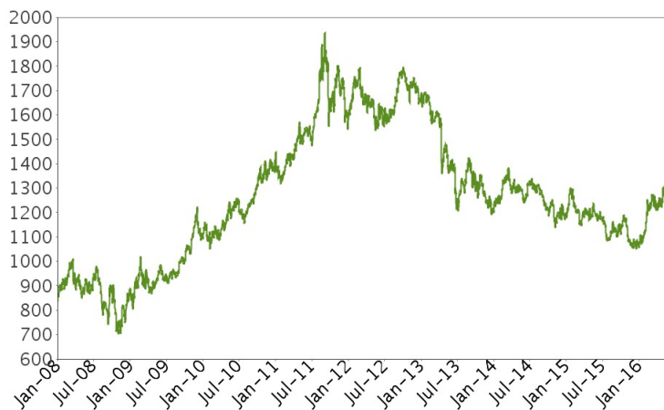
Historical Performance of the Gold Futures Contract

This historical data on the Gold Futures Contract is not necessarily indicative of the future performance of the Gold Futures Contract or what the value of the notes may be. Any historical upward or downward trend in the price of the Gold Futures Contract during any period set forth above is not an indication that the price of the Gold Futures Contract is more or less likely to increase or decrease at any time over the term of the notes.