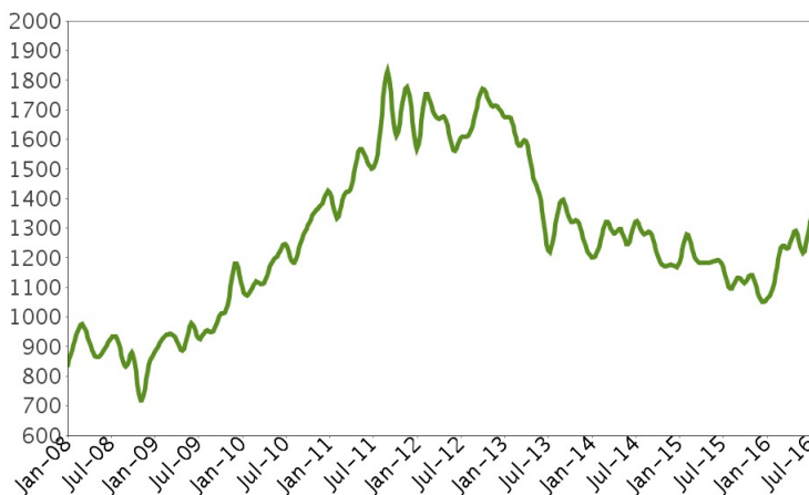
Historical Performance of the Gold Futures Contract

This historical data on the Gold Futures Contract is not necessarily indicative of the future performance of the Gold Futures Contract or what the value of the notes may be. Any historical upward or downward trend in the price of the Gold Futures Contract during any period set forth above is not an indication that the price of the Gold Futures Contract is more or less likely to increase or decrease at any time over the term of the notes.